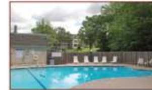
{ Heated Outdoor Swimming Pool with Privacy Fence }