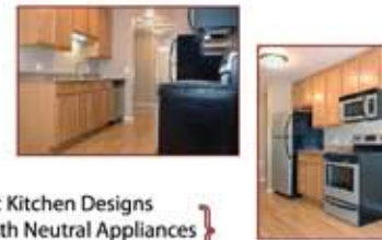
{ Classic Kitchen Designs with Neutral Appliances }